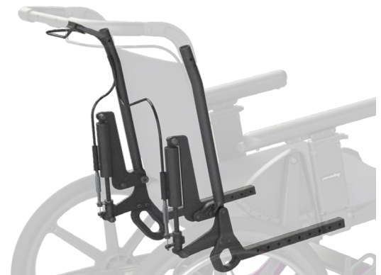
Reclining Backrest | up to 30° of recline